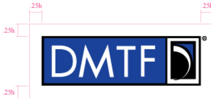
127 128 Figure 4 – DMTF logo buffer space

126 Where logo height is (h), the required buffer space is .25h.