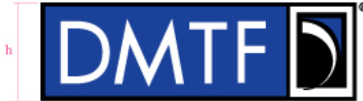
123 124 Figure 3 – DMTF logo height

121 The logo must have a “buffer” space around it to maintain legibility and visual impact. No other graphic 122 elements, such as typography, rules, pictures, etc., should infringe upon this space.